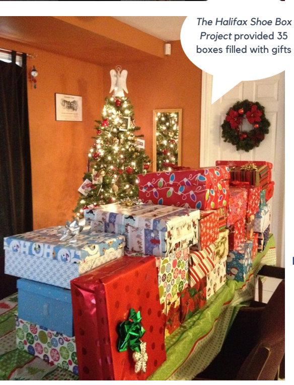
The Holiday season is an exciting time in the Coverdale office. It represents a time of giving, and of receiving. A time where community comes together and provides for women and families whose lives are affected by poverty, incarceration, and other difficult circumstances. This year was no exception. Through dangtions that came from the

women and families whose lives are affected by poverty, incarceration, and other difficult circumstances. This year was no exception. Through donations that came from the many churches and community groups that support the work that we do, we were able to offer gifts to so many who would have otherwise gone without. Our annual Holiday Party at the Coverdale office was a lovely gathering enjoyed by many service users, staff and volunteers.