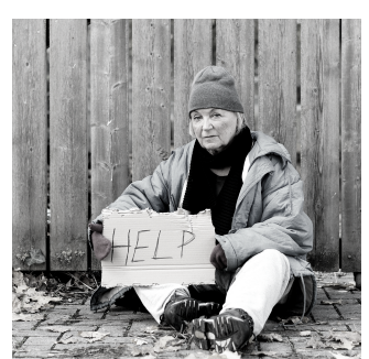
Are experiencing homelessness