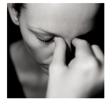
Have survived trauma & violence