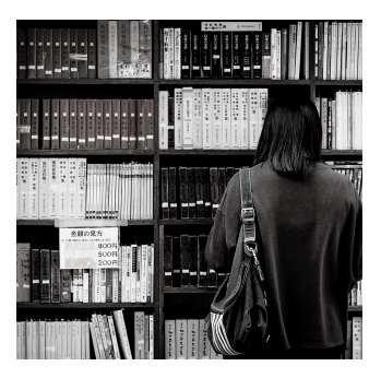
Have no post secondary education

African Nova Scotians and Indigenous people represent about two and four per cent of the population, respectively, but are over-represented in the province's jail system. About 16 % of youth sentenced to a youth correctional facility are African Nova Scotian. The proportion of Indigenous adults in custody is about 9 times higher than their representation in the adult population (3%).